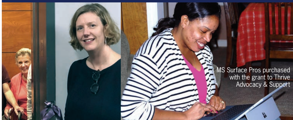
MS Surface Pros purchased with the grant to Thrive Advocacy & Support