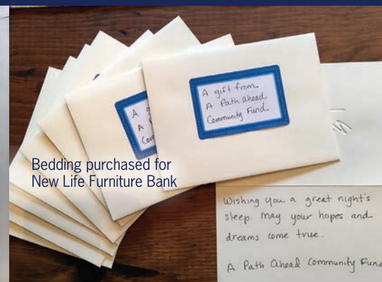
Bedding purchased for New Life Furniture Bank