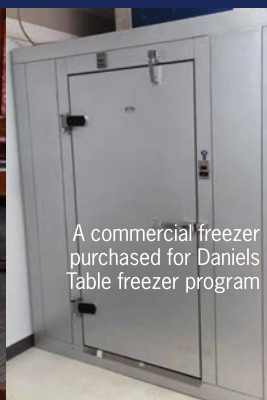
A commercial freezer purchased for Daniels Table freezer program